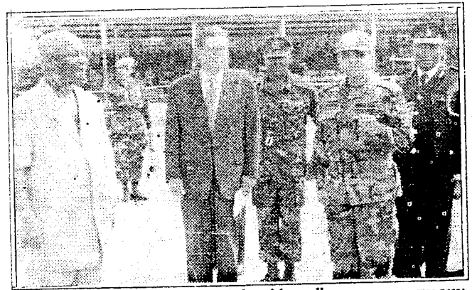
Vice president Berewa at Makeni handing over ceremony

Speaking at the ceremony at the Wusum Grounds in the provincial headquarter town of Makeni, Vice President Berewa said the "significant, moving and sad moment" of transfer was a manifestation that "UNAMSIL have accomplished their mission". He praised the peacekeepers' "immense contributions to the return of peace to Sierra Leone" as well as their humanitarian and other social assistance to the com-