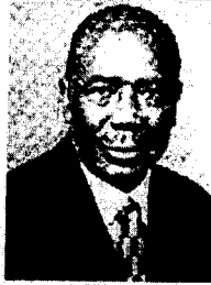
Tejan Kabbah: Named

of the country was in motion, he used his walkie-talkie hand set to direct the route of the pilot in order to avoid enemy fire from the ground. He said after the helicopter safely left Sierra Leone, he was not aware as to where the President was heading for until he eventually met him in Conakry, in the Republic of Contd: page 2