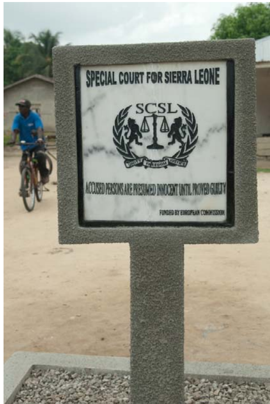
War memorial at Talia Yawbeko