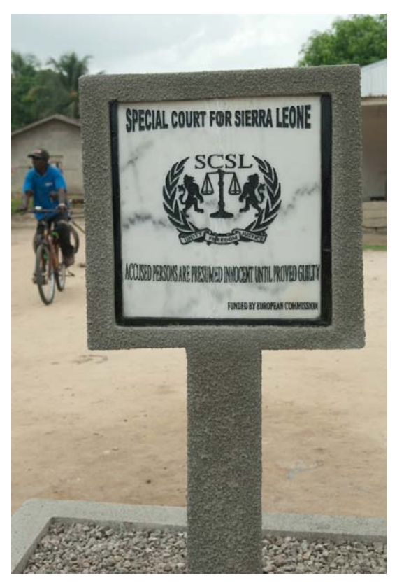
War memorial at Talia Yawbeko