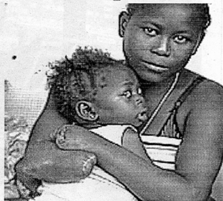
See how Gaddafi's wealth destroyed her

ogy. What the retired military officer had aimed at was to brainwash students as well as intellectuals about his political philosophy and targeting students or this group of intellectuals was in place since they are the future leaders of the world. Having failed to achieve that goal due to the smartness, vigilance and cunning na-