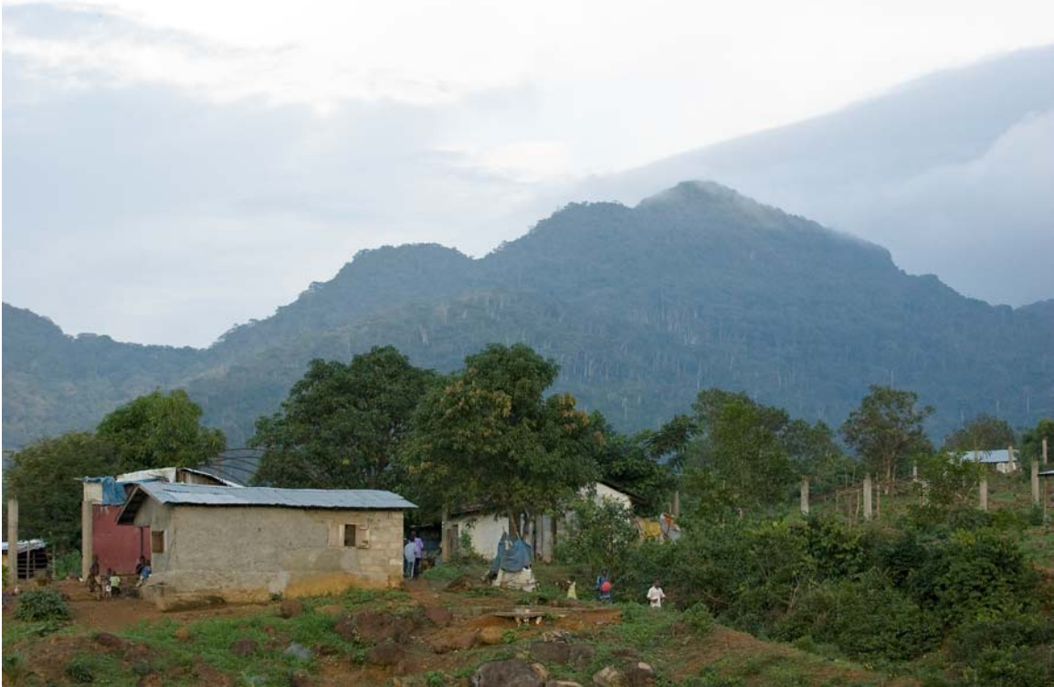
View from Lumley