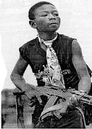
He was taught to shoot and kill as an enemy to both Mankind and the state.

It is written in the book of Proverbs that "Man is selfish and self-centered, Greedy and Corrupt, he can be violent for want of wealth...Better is the poor who walks in his integrity than he who is crooked though he is rich" Proverbs 28:6 Col. Muammar Gaddafi