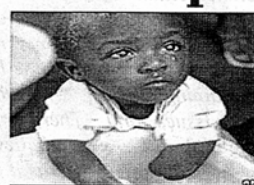
Even this baby was not spared