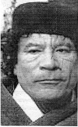
Col. Gaddafi... to repent?