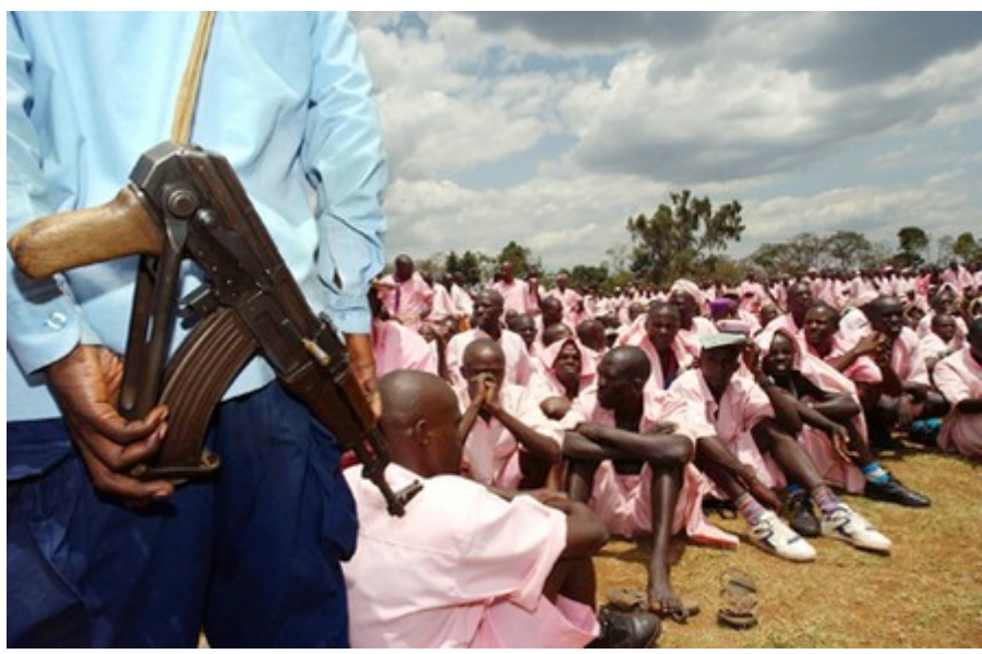
A file photo shows prisoners suspected of taking part in the 1994 Rwandan genocide.

The Netherlands is ashamed for its absence during the genocide by the Hutus in Rwanda in 1994. That is why it is afraid to demand that the Tutsis - and France - be tried too.