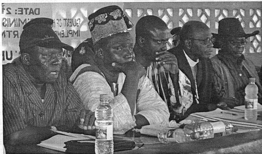
The high table