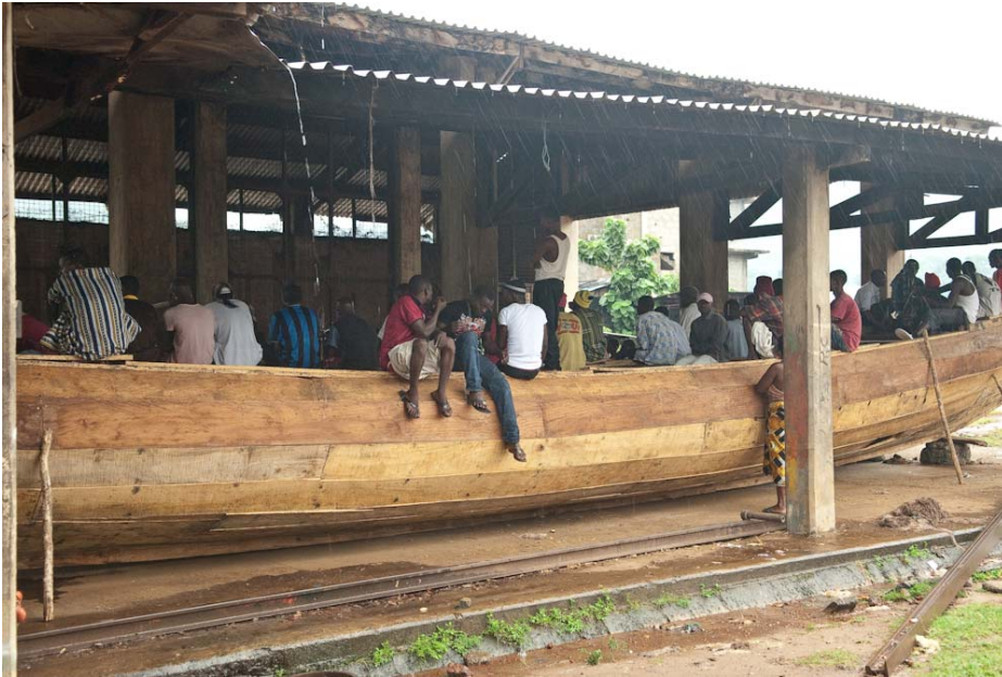
Sitting in the 'boat-yard' at Tombo.