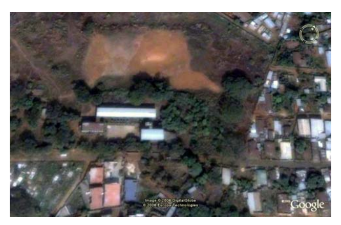
Sierra Leone Grammar School, Murray Town