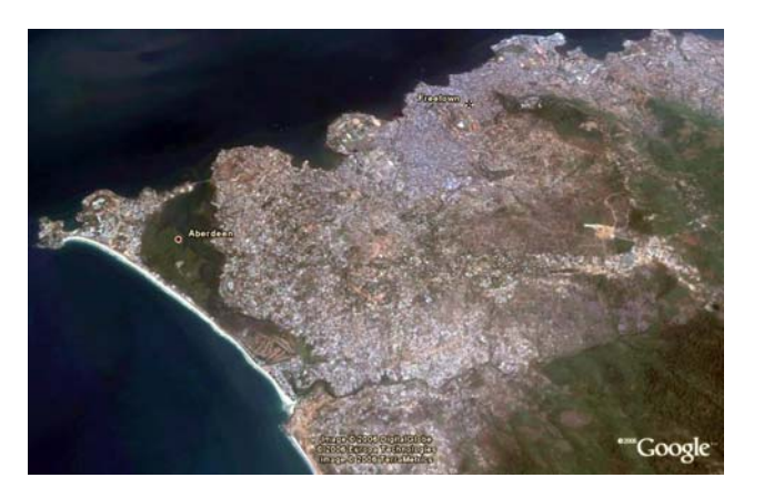
Aberdeen and Freetown