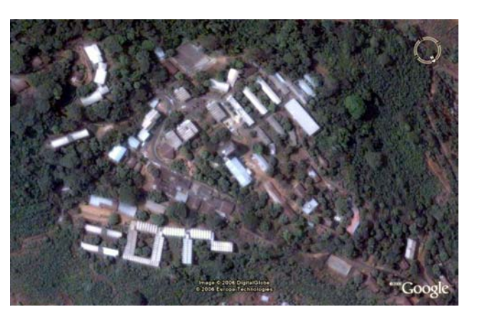
Fourah Bay College, atop Mount Aureol