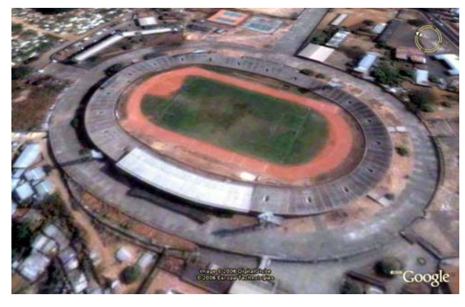
The National Stadium