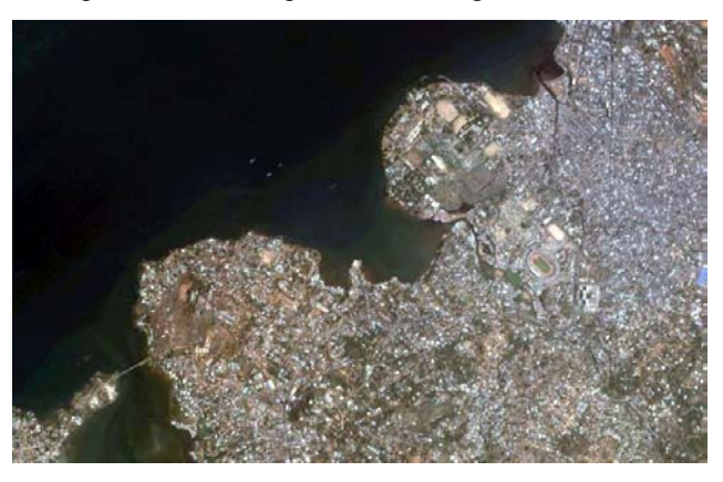
Aberdeen Bridge, Murray Town, Kingtom and Freetown