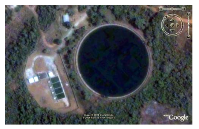
Babadorie Dam, Regent