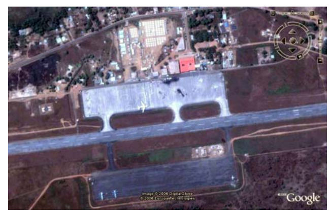
Lungi International Airport