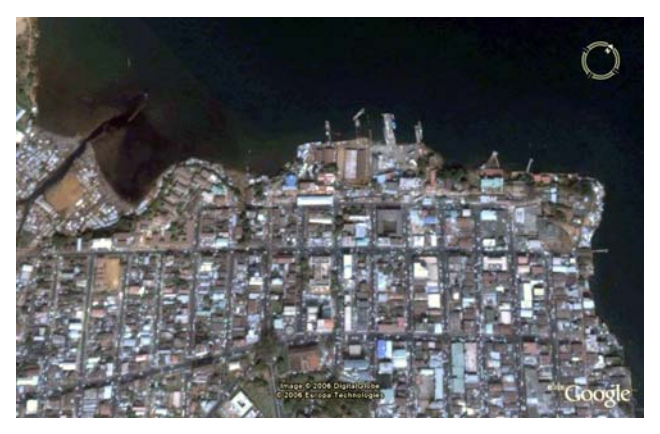
Central Freetown, Government Wharf