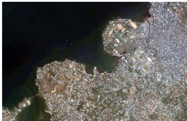
Aberdeen Bridge, Murray Town, Kingtom and Freetown