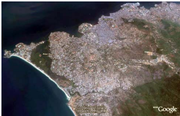
Aberdeen and Freetown