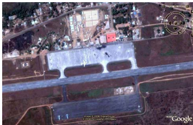
Lungi International Airport