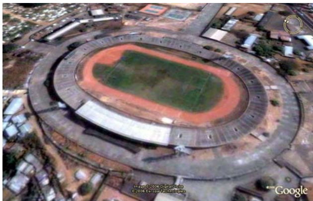
The National Stadium