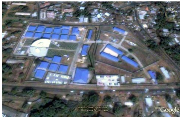
The Special Court complex in New England