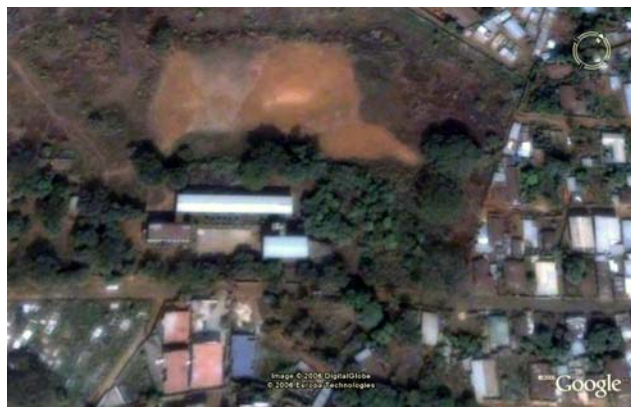
Sierra Leone Grammar School, Murray Town