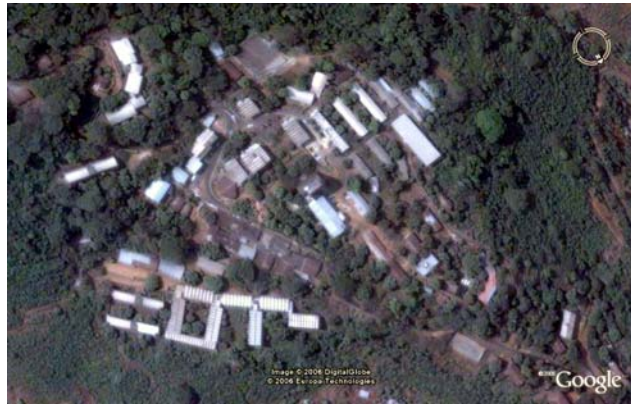
Fourah Bay College, atop Mount Aureol