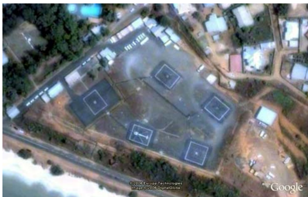
The UNIOSIL helipad.