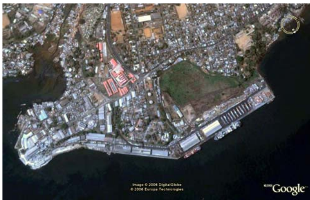
Queen Elizabeth II Quay, Cline Town