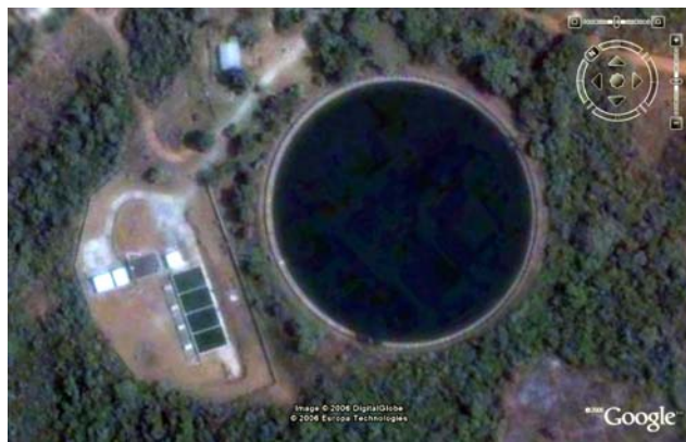
Babadorie Dam, Regent