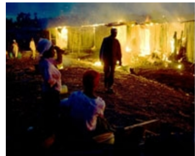
Homes in the western Kenyan town of Kericho go up in flames during ethnic clashes with Kikuyu rivals. The presidential post-election violence of 03 Feb 2008 will be investigated by a newly formed Truth, Reconciliation, and Justice Commission.