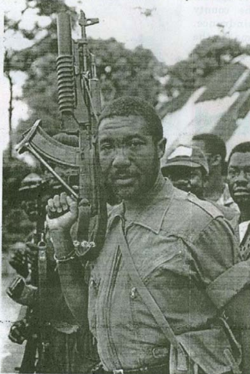
Charles Taylor is on trial in The Hague facing 11 charges including murder

We, as Africans, need to free ourselves from blaming colonialism and the west for our problems. The violence in Liberia and Sierra Leone was black-on-black violence. We can argue about whether or not the west paid for the bullets, but these were African hands on the trigger. For Africa to move on and assert its rightful place in global affairs, we need to have an honest conversation with ourselves about governance and violence. The Taylor case is a