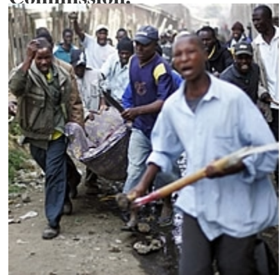
In another incident to be probed by the TRJC panel, angry members of the Luo tribe carry another Luo after he was attacked by a Kikuyu crowd during ethnic clashes in the central Kenyan town of Nakuru, 25 Jan 2008