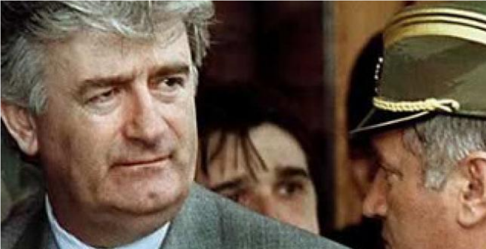
The Hague, Netherlands

Prosecutors in the Radovan Karadzic case have to present the court with a written document showing how his trial can be settled more quickly, judges at the Criminal Tribunal for the Former Yugoslavia (ICTY) said on Thursday.