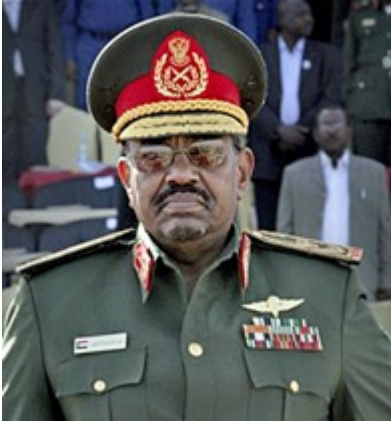
Sudanese President Omar al-Bashir (file photo)

The chief African Union-United Nations mediator for Darfur says the indictment of Sudan's president for atrocities committed in Darfur has likely "significantly slowed and even compromised" efforts to find a political solution to the conflict.