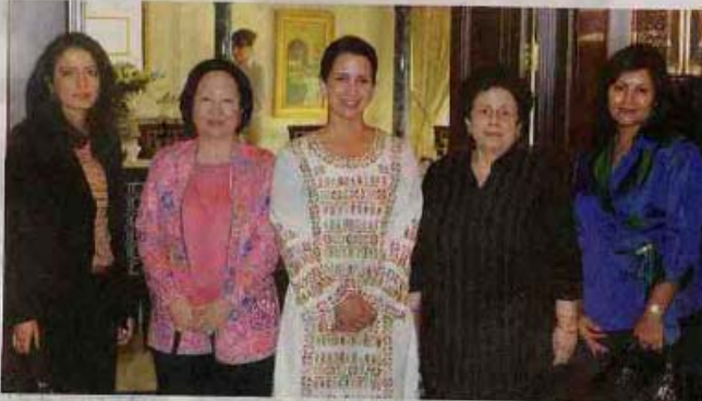
الأميرة هيا والسيدة الأولى في سنغافورة وعدد من السيدات

الدولتين وتطرقنا أيضا إلى عدد من الشؤون الأخرى بما في ذلك الدور الذي تلعبه المرأة في الدولة ومساهماتها الفاعلة في مختلف المجالات. كما التقت سمو الأميرة هيا بنت الحسين أمس أمين سجل المحكمة الخاصة بسيراليون هيرمان فون هيبيل الذي يزور المنطقة حاليا لحشد الدعم للمحكمة الدولية التي تسعى لبسط يد العدالة وسيادة القانون في البلد الأفرريقي الذي خرج قبل بضع سنوات فقط من حرب أهلية مدمرة. وأطلع فون هيبيل سمو الأميرة هيا على النموذج المميز للعدالة الدولية الذي تجسده المحكمة وعلى المساهمة الإنسانية الفاعلة للمحكمة تجاه إحلال السلام والمصالحة في سيراليون عقب الحرب الأهلية المدمرة التي استمرت 11 عاما خلال الفترة الواقعة بين عامي 1991 و2002. ويعمل ممثل المحكمة الخاصة بسيراليون على اطلاع المسؤولين في الحكومات والشخصيات المهمة على التقدم الذي حققته المحكمة الدولية في سياق الدور المتطور بها لإحقيق الحق وفرض سيادة القانون في سيراليون حيث تطارد القارين من العقاب وتدير برنامجا خاصا لتطوير القانون وبناء ارث من العدالة للأجيال القادمة. وكانت المحكمة الخاصة بسيراليون تأسست عام 2002 بموجب اتفاقية بين الحكومة السيراليونية والأمم المتحدة وذلك بناء على طلب من الحكومة السيراليونية جراء الجرائم الوحشية المرتكبة ضد الإنسانية وذلك على أمل تطوير المجتمع وجعله أكثر أمنا كما تشكل هذه المحكمة قاعدة أساسية لعمل المحاكم الدولية الأخرى.