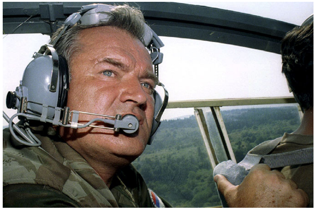
Mladic's forces killed an estimated 8,000 men and boys during the Srebrenica massacre in

Capturing the former commander of the Bosnian Serb Army is a positive step towards ending impunity for genocide.