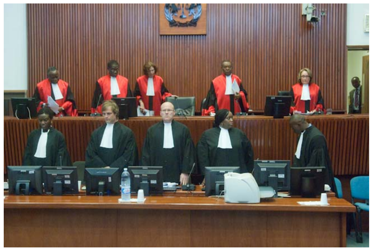
The Court rises for the last time in Freetown. See photos from yesterday's RUF Appeal Judgment in today's 'Special Court Supplement'.