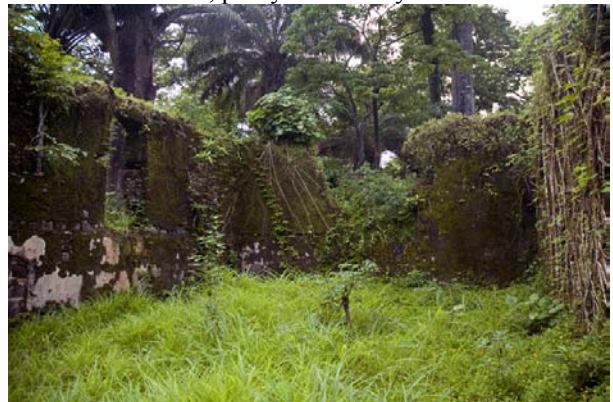
The slave-holding area was open to the elements.