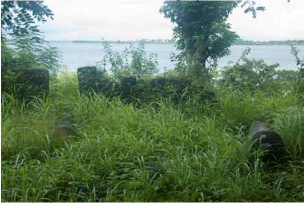
...looking out to sea.