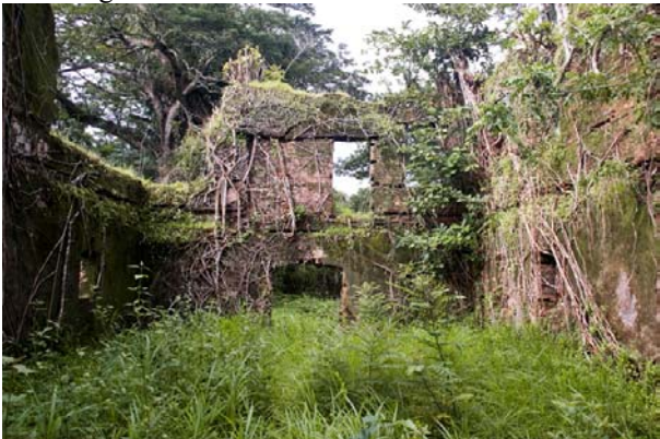
The interior of the residence.