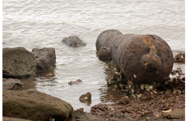
An ancient cannon, partly covered by water.