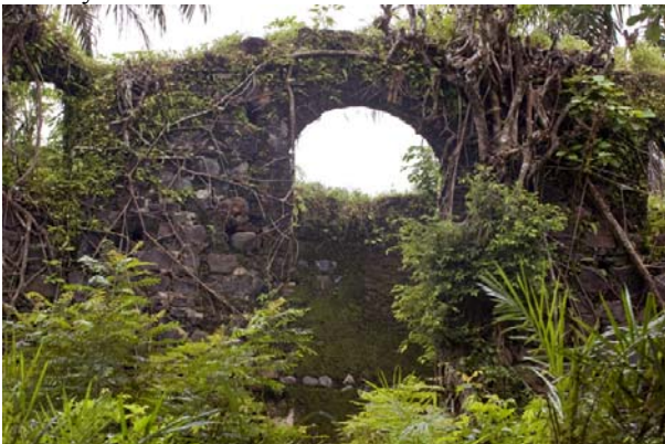
The ruins of the gate to the slave-holding area.