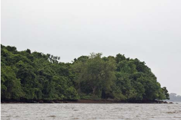
Heavily forested Bunce Island from the sea.