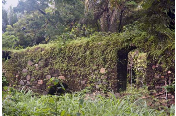
Wall of the residential area.