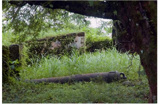
A line of cannons remains on the heights...