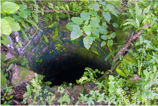
The remains of a water well, long dry.