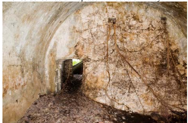
The inside of the ammunition magazine.