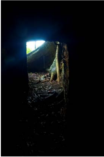
The door of the magazine, from inside.