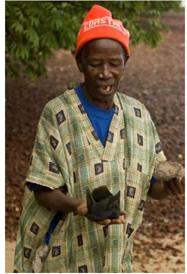
...but not always historically accurate.