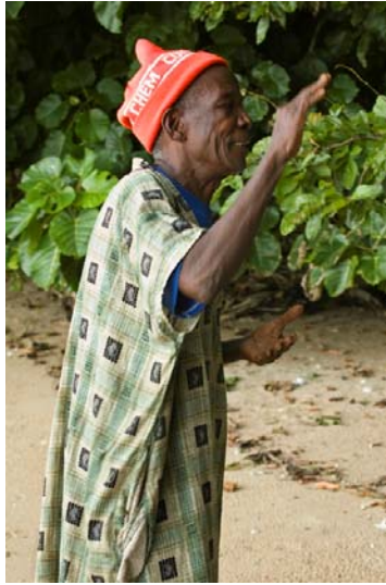
The caretaker's stories are colourful...