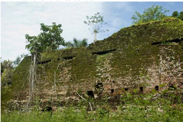
Trees now grow on top of the walls.