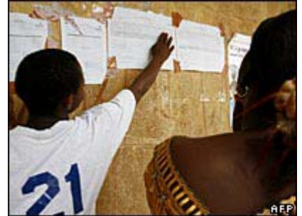
Voters showed great enthusiasm for the poll

The violence is worrying not just for Sierra Leoneans but also for the neighbouring countries in this fragile region, he says.