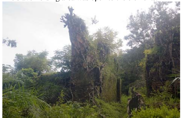
The path which led to the slave ships.