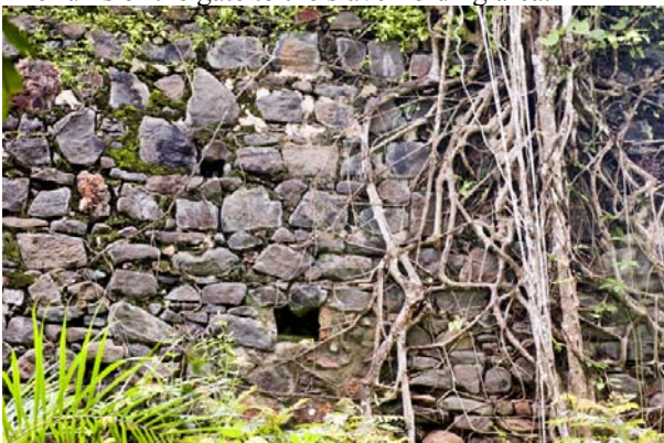
Vines help to hold the fort ruins together.