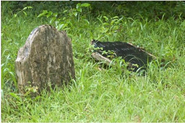
The cemetery, a short way through the forest.