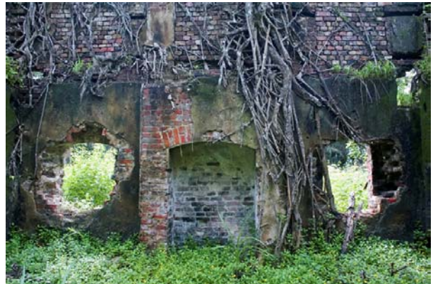
The residence had a fireplace without a chimney.