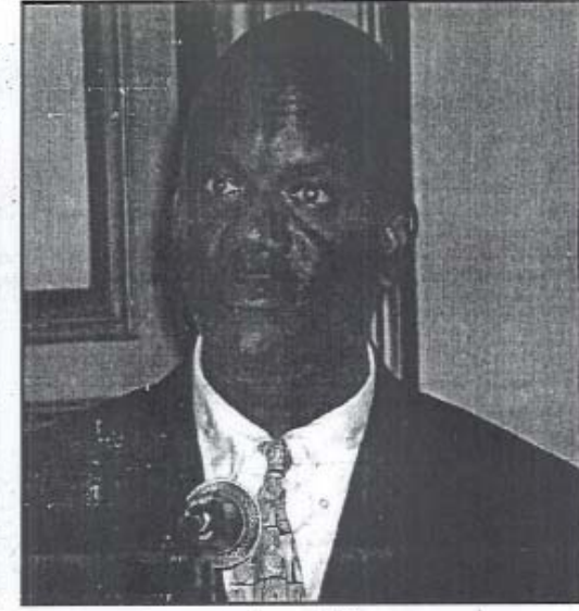
Special court judges