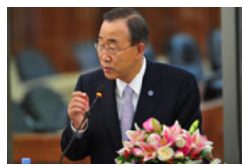
Secretary-General Ban Ki-moon addresses Extraordinary Chambers in the Courts of Cambodia (ECCC)

The United Nations-backed tribunal in Cambodia dealing with mass killings and other crimes committed under the Khmer Rouge three decades ago is crucial in the world's fight against impunity, Secretary-General Ban Ki-moon said in the South-East Asian nation today.