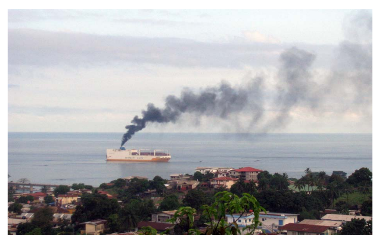
A cargo ship contributing to 'global warming'.