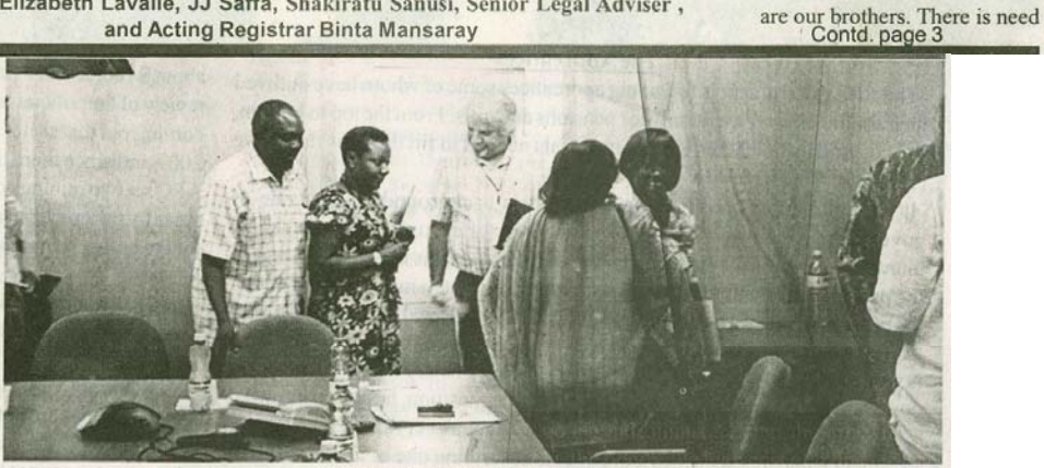
Chatting after the meeting