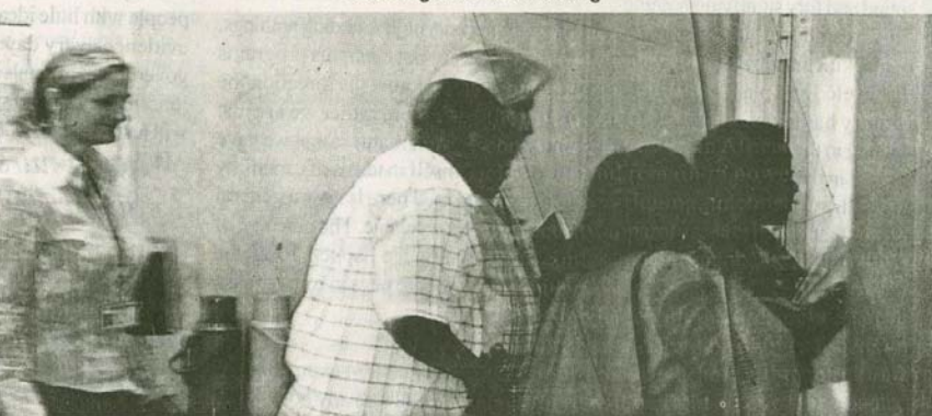
Leaving the conference room of the Special Court where fruitful discussions were held