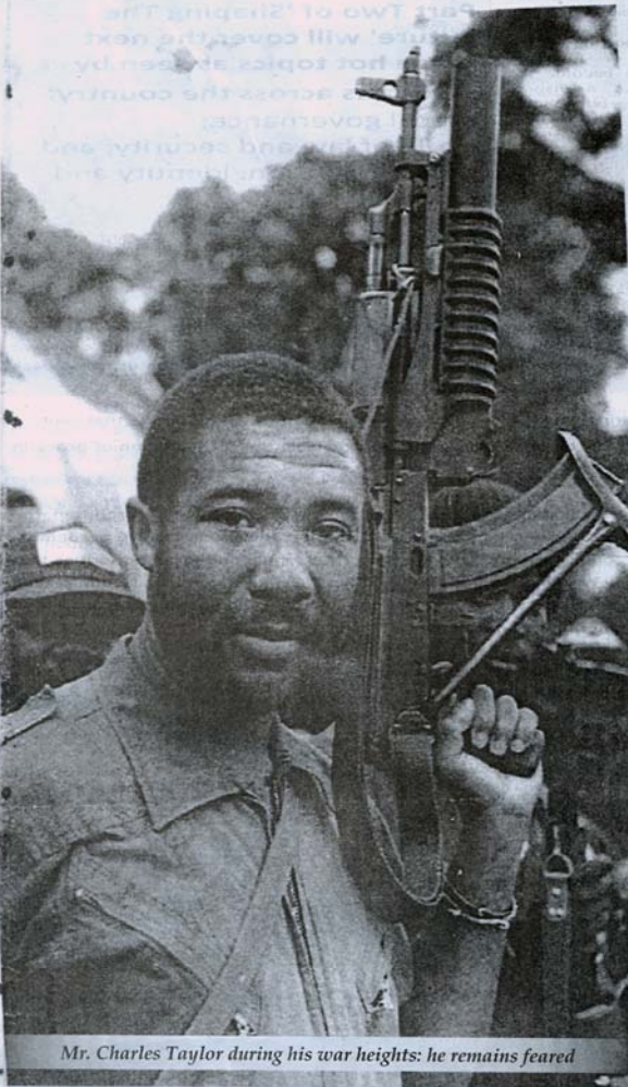
Mr. Charles Taylor during his war heights: he remains feared

The foundations of the peace treaty that ended the war for Mr. Taylor's exit were fluid. Unlike in similar countries with similar