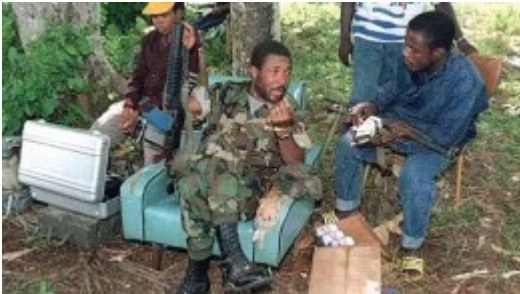
Charles Taylor during the civil war.