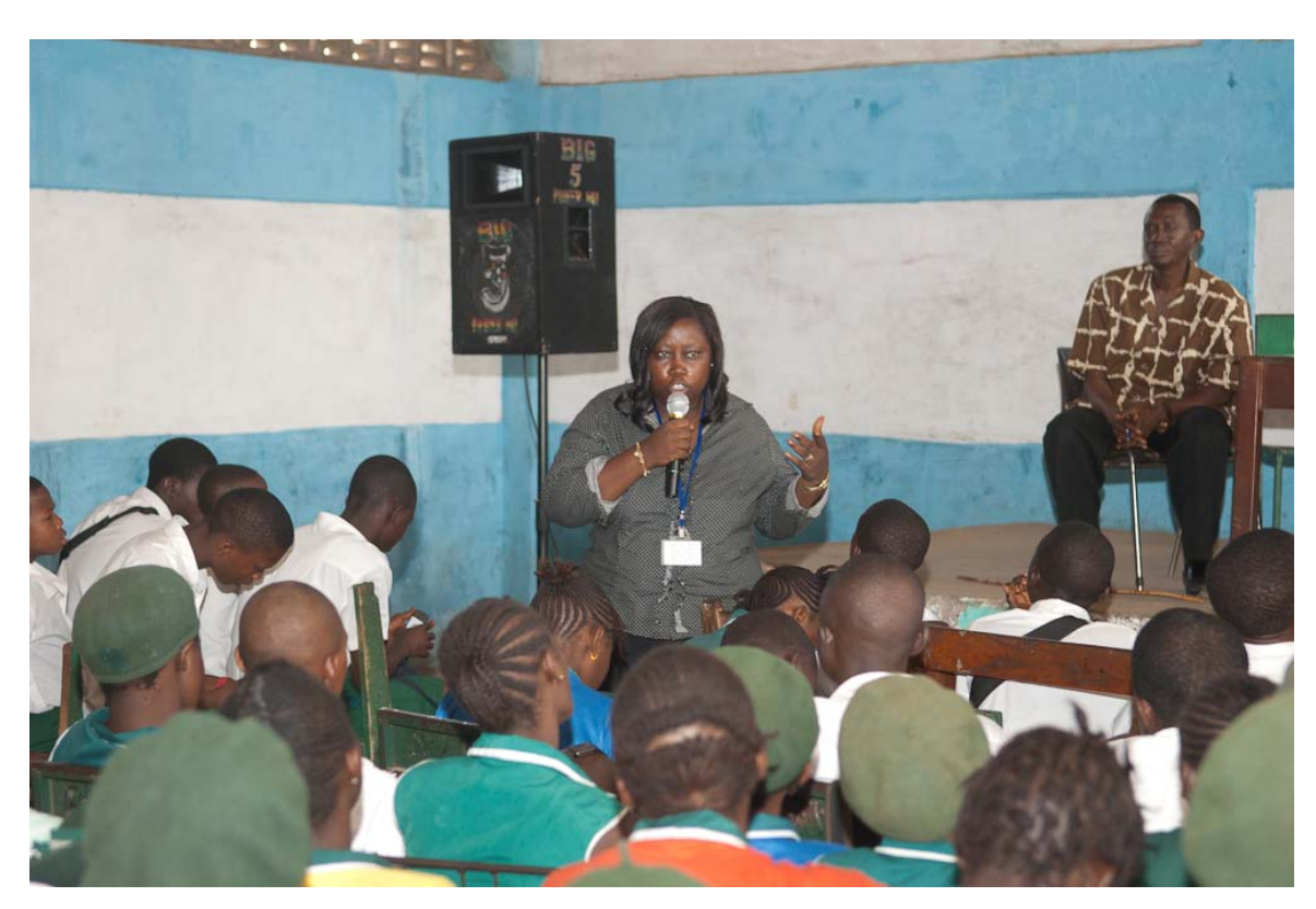
For more photos of today's Outreach at the Bishop Johnson Memorial School, see today's 'Special Court Supplement'