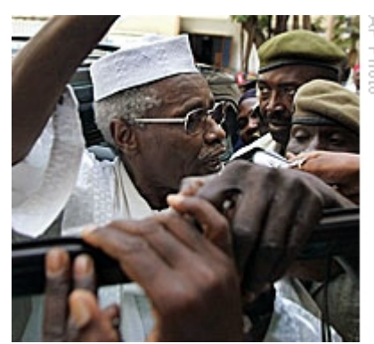
A 2005 file photo of former Chad dictator Hissene Habre seen leaving the court in Dakar, Senegal

The United Nation's highest court rejected a bid by Belgium to force Senegal to keep Hissene Habre in custody -- after Dakar vowed it would not let the former Chadian dictator go. But the ruling still leaves open when -- if ever -- Habre will face trial for alleged human rights violations.