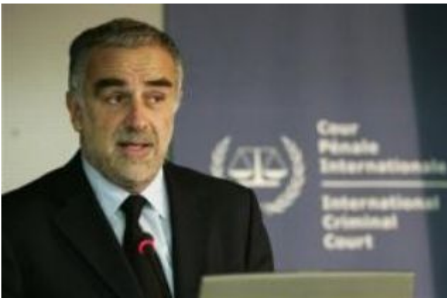
Luis Moreno Ocampo

December 2, 2010 (ADDIS ABABA) – The Peace and Security Council of the African Union (PSC) has urged the International Criminal Court (ICC) defer its arrest warrant against Sudanese President Omar Hassan al-Bashir.