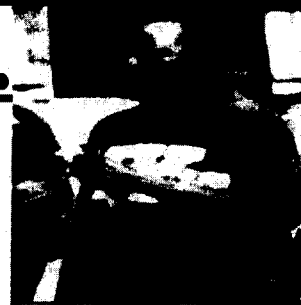
Special Court Inditee Norman