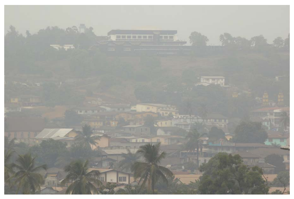
Sierra Leone's Parliament building, partially obscured from view by the Harmattan dust.