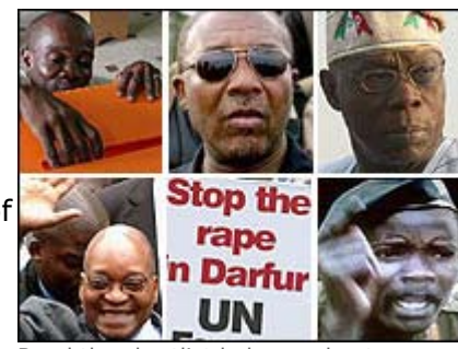
Read the shortlist below and vote or the right

World headlines, meanwhile, were dominated by the mass African migrant exodus to the Canaries; Madonna's adoption of a one-year-old in Malawi and China's growing influence on the continent.