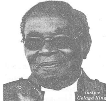
Justice Gelaga King

With the greatest respect to my learned colleagues, at