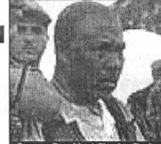
Former President Charles Taylor