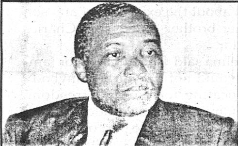
Former President Charles Taylor