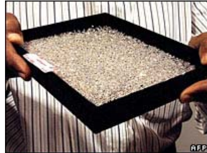
Liberia must join an international diamond-certification scheme

Correspondents say the UN decided Liberia has made enough progress, but that it must certify diamonds for sale do not originate from conflict zones.