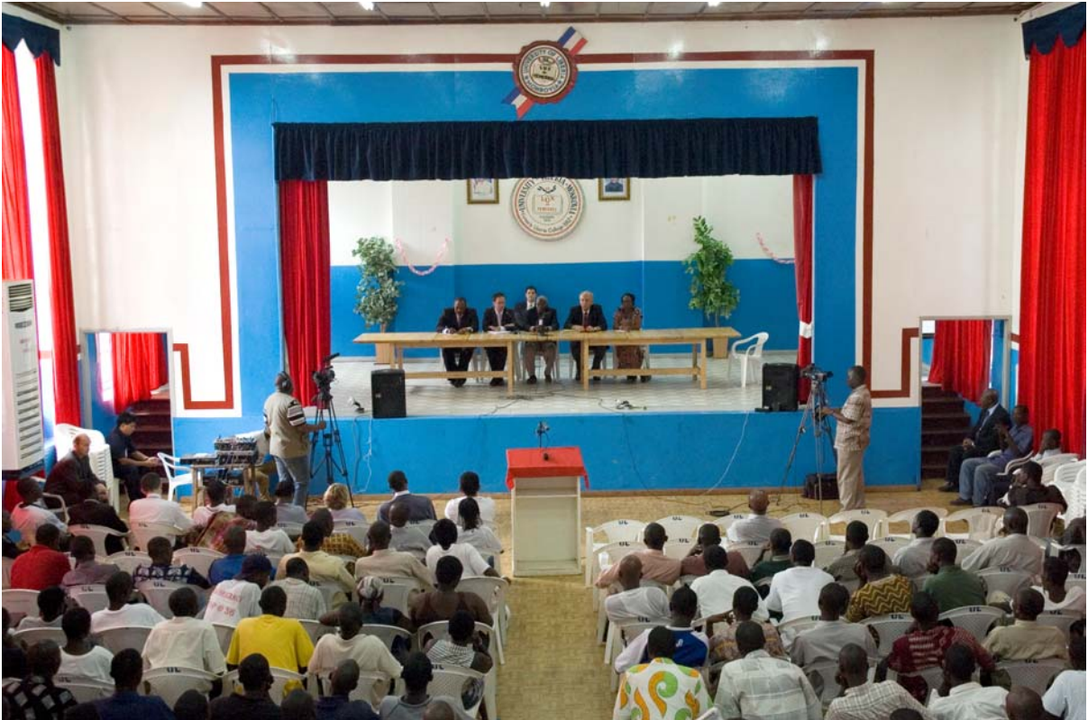
Outreach at the University of Liberia