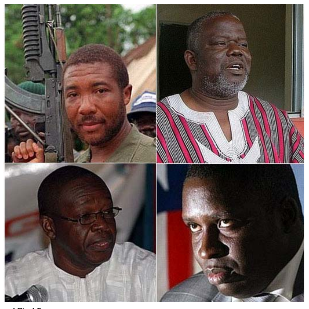
(l-r) ABOVE: Charles Taylor and Gen. Prince Johnson; BELOW: Alhaji Kromah and Sekou Damate Conneh

MONROVIA – Liberia's Truth and Reconciliation Commission (TRC) has asked the United Nations (UN) Security Council for its full support in prosecuting individuals, including ex-warlords, indicted for their alleged involvement in the commission of war crimes and gross human rights violations during the country's prolonged armed conflict.