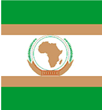
African Union flag

no developing country has ever done something like that before. But Senegal has the partners that are ready to finance the trial. Many of the victims whom I work with don't believe that Senegal has the political will to bring Hissene Habre to trial," he observes.