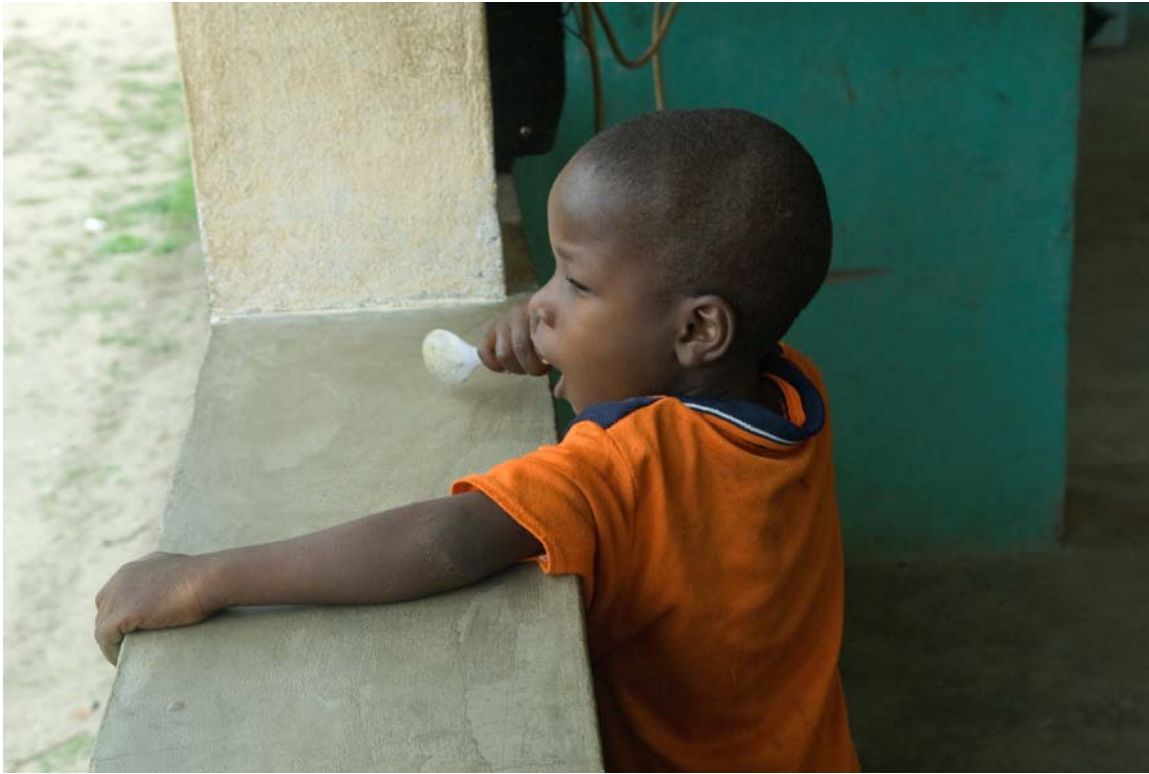
A little boy at Talia Yawbeko looking into his future.