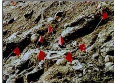
Several mass graves have been discovered near Srebrenica

In an attempt to win over Serbian nationalists - who see the resolution as perpetuating an unjust portrayal of Serbs' role in the war - the government has promised another future resolution, condemning all crimes in the former Yugoslavia.