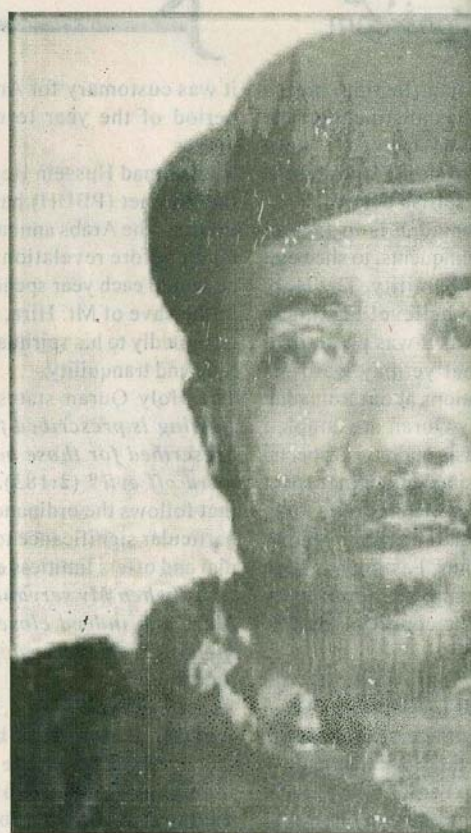
Former Liberian President Charles Taylor now defend