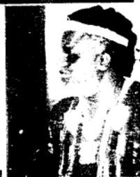
Sankoh: RUF leader

Sources close to International Human Rights Organizations abroad have intimated The Exclusive that the legal services of some eight international lawyers have been sought to represent