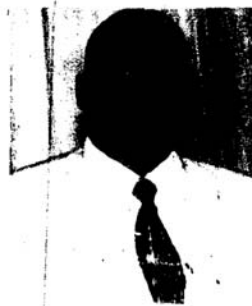
Johnny Paul Koroma