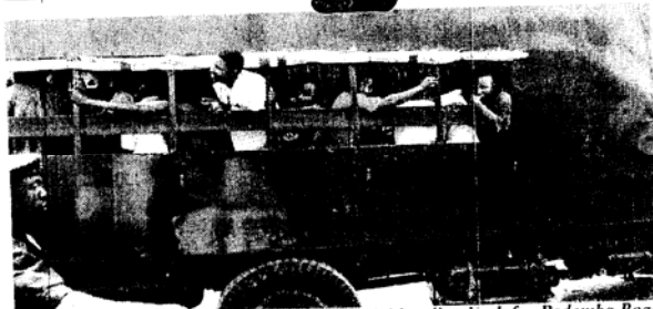
The other prisoners in the Foday Sankoh trial heading back for Pademba Road Prisons singing, the police and Prison officers drove back the prisoners to the Central Prison in their singing mood; which attracted the attention of passersby.