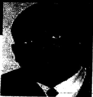
Johnny Paul - fugitive

Community to extradite the former junta leader, if he happens to be residing outside Sierra Leone. According to him, whether Johnny Paul is up in arms or not, wherever he may be hiding, the CDU will go for him if his