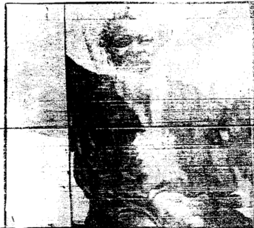
Sankoh - call to justice