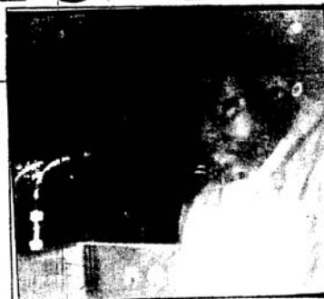
Johnny Paul Koroma

1997 military coup whilst in prison for a pending treason trial. Once out of prison, Paul described himself as "God's anointed" leader. He predicted an imminent doom for Sierra Leone and added that he would not relinquish power to the democratically elected government of President Kabbah.