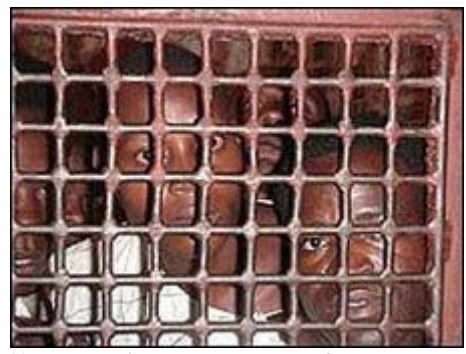
Kenyan prisoners can spend years locked up awaiting trial

Since then more than 4,000 people have been on death row in the country's overcrowded, underfunded prisons.