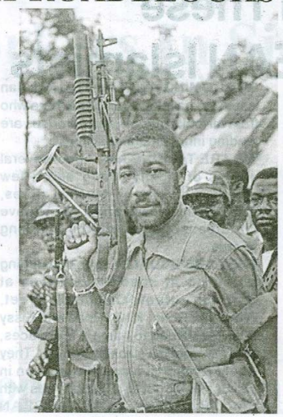
Taylor the warlord

He also conceded atrocities were committed in