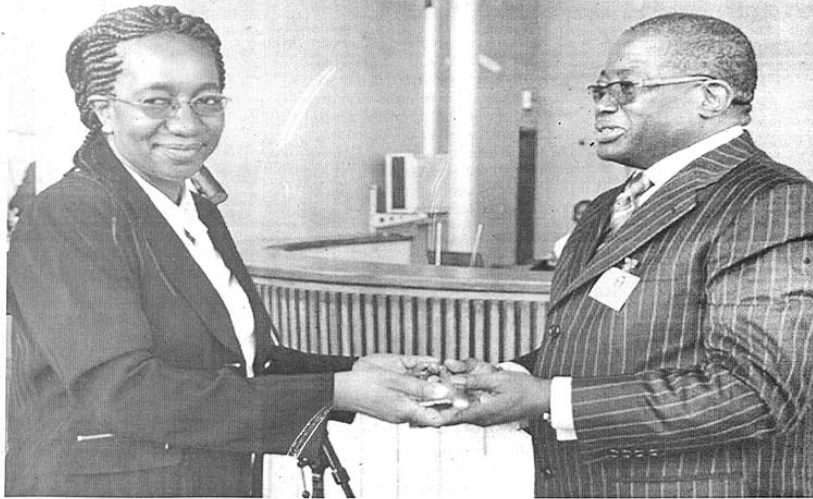
The building will now house the Supreme Court of Sierra Leone.

The courthouse saw the trials of leaders of the Civil Defence Forces, the Revolutionary United Front, and the Armed Forces Revolutionary Council, as well as the initial appearance of former Liberian President Charles Taylor. These trials saw first-ever convictions for attacks against UN peacekeepers, forced marriage as a crime against humanity, and for the use of child soldiers.