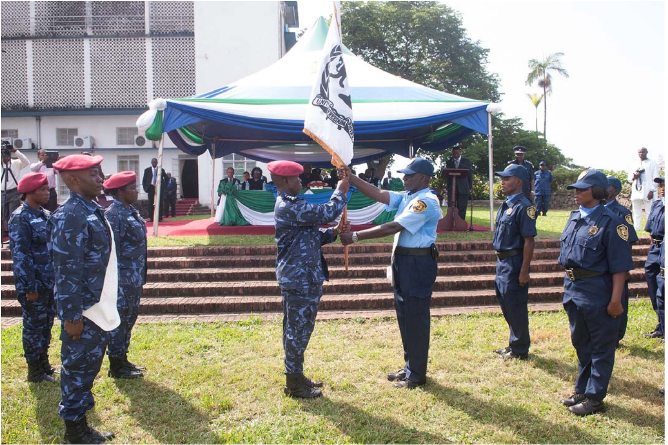
The handing over of the Special Court flag at State House