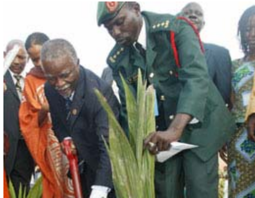
South African President Thabo Mbeki plants a tree during the African Union summit in Banjul

“Sierra Leone is in peace building and we are using the experience gained to replicate it in the (Democratic Republic of) Congo, Darfur and other areas of tension,” Annan said.