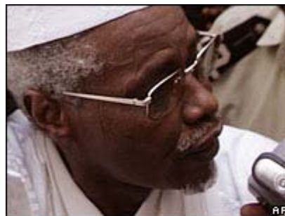
Chadians have been trying to bring Mr Habre to justice for 15 years

Mr Habre, 64, denies any knowledge of murders and torture.