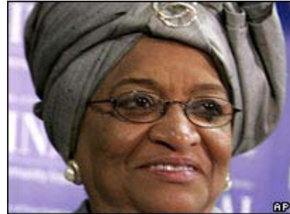
Ellen Johnson-Sirleaf was elected as president last November

Diamonds fuelled the civil wars in Liberia and Sierra Leone in recent years.