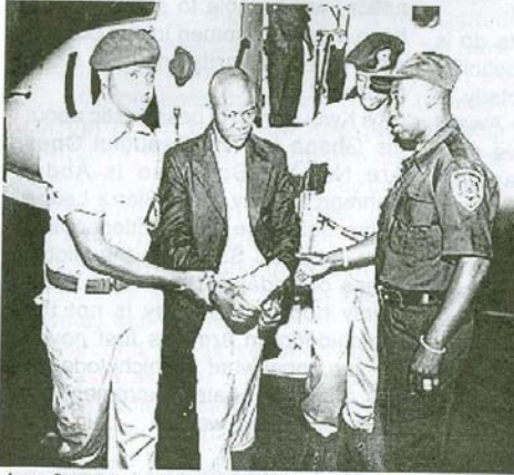
Issa Sesay being handed over to prison authorities on landing at Kigali International Airport