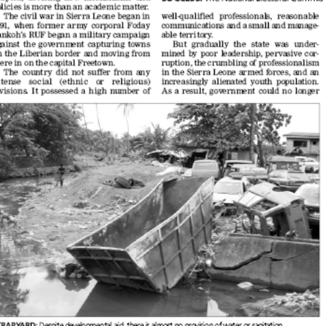
SCRAPYARD: Despite developmental aid, there is almost no provision of water or sanitation