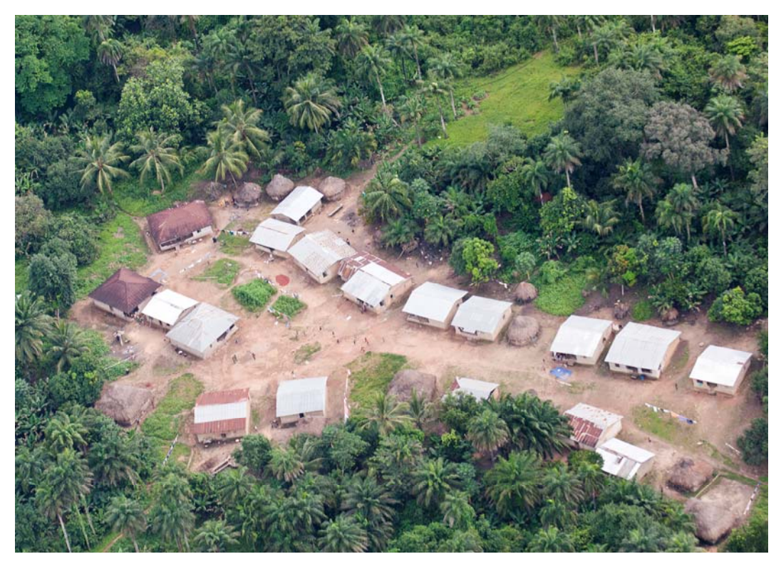
Aerial view of a village in northern Sierra Leone