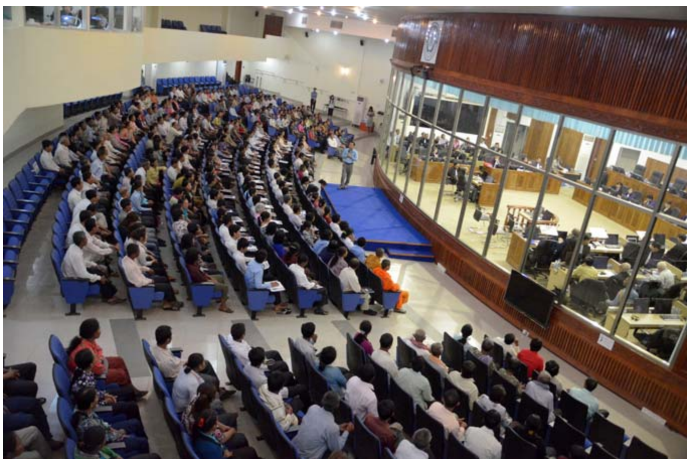
Two former Khmer Rouge leaders are currently being tried for crimes against humanity.

Ongoing trial of two ex-regime leaders could be disrupted as more than 200 employees abstain from work demanding wages.