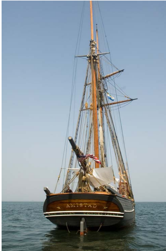
The Amistad during its visit to Sierra Leone in 2010.