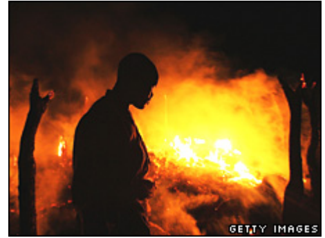
The war in Darfur began in 2003 when rebel groups took up arms

I asked him how the Sudanese officers had justified killing unarmed civilians in cold blood. How they had explained the need to slaughter women, babies and children?