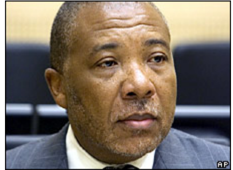
Charles Taylor is accused of backing Sierra Leone's rebels

It was moved to the Netherlands from Sierra Leone's capital Freetown out of fear that it could foment instability in Sierra Leone and Liberia.