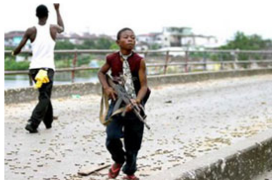
An estimated 120,000 people died during the 10-year conflict in Sierra Leone