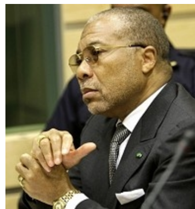
Former Liberian President Charles Taylor sits in courtroom prior to hearing of witnesses in trial in The Hague, 08 Jan 2008