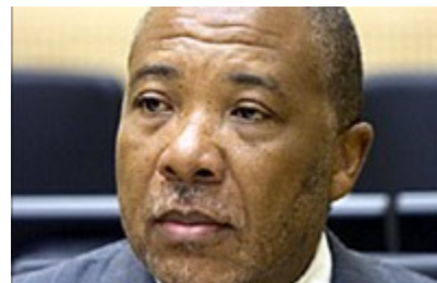
Former president Charles Taylor

The BBC reports: War crimes judges have rejected a request to acquit Liberia's former President Charles Taylor on charges of crimes against humanity.