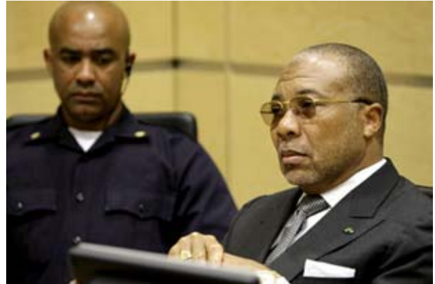
Charles Taylor has pleaded not guilty to charges of mass murder, rape and mutilation

The former Liberian president is accused of arming, training and controlling RUF rebels, blamed for many of the mutilations, and of being involved in the trade of so-called "blood diamonds".