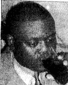
Johnny Paul Koroma

By Salamatu Turay Peace and Liberation Party (PLP) Member of Parliament Hon. Hassan Kamara, yester- day denied rumours that the leadership of the party will change fol- lowing the disappear- ance of its leader Hon. Johnny Paul Koroma