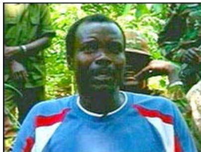
Joseph Kony calls himself a freedom fighter

Mr Kony and four others were indicted by the ICC for war crimes last year.