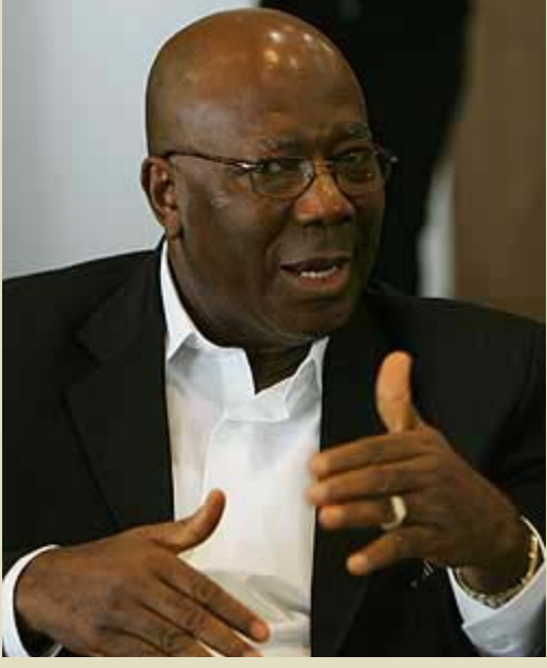
President Kabbah has denied allegations that he once used mercenaries and trafficked weapons to Sierra Leone's Civil Defense Forces.

Scholars are divided over the usefulness and counterproductiveness of the truth commission and the special court in Sierra Leone. One argument that stands out the most among many Sierra Leonean scholars supports the detainees' claim that the special