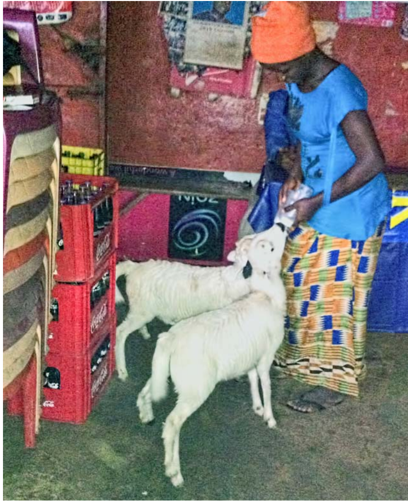
Taken at Jui Junction.