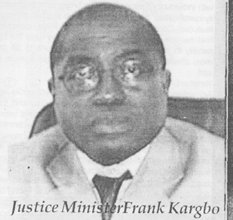
Justice Minister Frank Kargbo

bly on 15th March 2006 by Resolution 60251, which established the Human Rights Council itself. It is a cooperative process which, by 2011, will have reviewed the human rights records of every country.