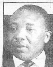
Charles Taylor, to The Hague