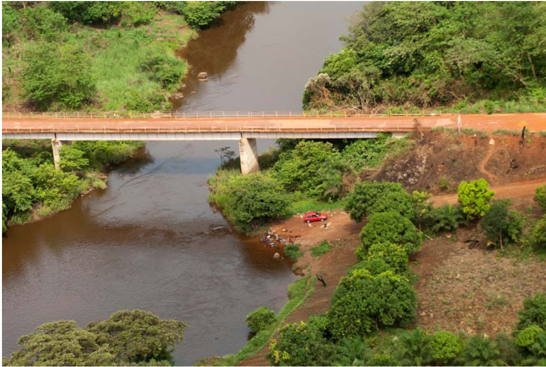
Arial view of Bumbuna Bridge