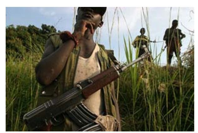
Justice systems are struggling to determine whether children should be treated as victims or perpetrators

JOHANNESBURG, 6 October 2011 (IRIN) - International human rights law meanders between the vague and the hazy when it comes to its stance on the age of criminal responsibility and what, if any, punishments should be imposed on child soldiers guilty of war crimes.