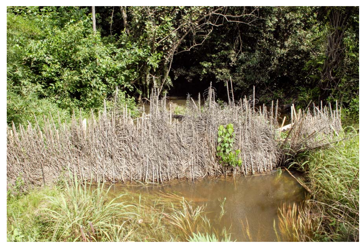
Fish trap in Kenema District