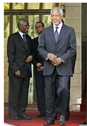
Former UN Sec. general Kofi Annan(R) leaves the offices of Kenyan Pres. Mwai Kibaki in Nairobi on 05 Oct 2009

"The local tribunal should actually be shielded from interference by those powerful elements, and actually criminal elements within our system," Kabaji said.